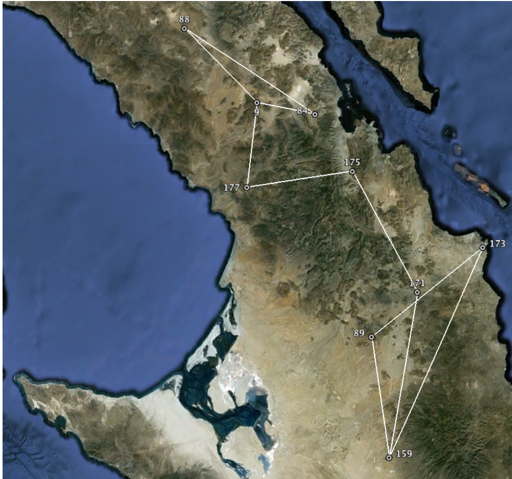
Figure 2: Population graph for the northern group of Araptus attenuatus populations.

> graph <- spatial.population.graph(pop = "baja", stratum = "Pop", + lat = "Lat", lon = "Long") > popgraph.on.map(graph, filename = "~/Desktop/popgraph.on.map.kml")