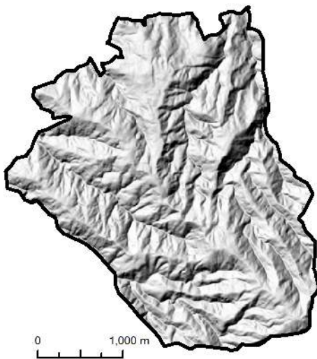
Figure 1: Hillshaded RBSF DEM

This vignette illustrates the use of RSAGA for terrain analysis following an application modeling landslide susceptibility in the tropical Andes (Muenchow et al. , 2012). The presence or absence of landslide initiation at 1535 sampling points in the natural parts of the perhumid Reserva Biologica San Francisco (RBSF) area are entered as the response to terrain variables in a generalized additive model (GAM). From a provided digital elevation model (DEM; figure 1) (Jordan et al. , 2005; Ungerechts, L. 2010) 2 , RSAGA is used to calculate the relevant terrain indices, transform grid data, and extract values to a data frame for statistical modeling. The GAM is demonstrated using package gam (Hastie, 2015), and model predictions applied to the collection of terrain grids using RSAGA grid tools.